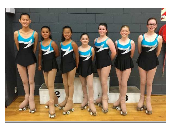
Mini Precision 1st Upper Hutt Rollers