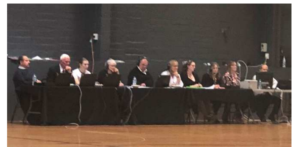
Several Upper Hutt Members on the Areas RollArt Panel